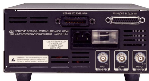
DS340 rear panel (w/ opt. 01)