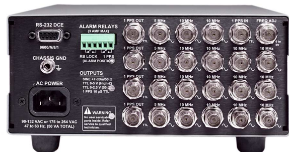
FS725 rear panel (with opt. 03)