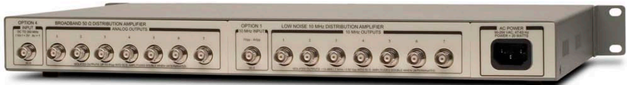
FS735/1/4 Rear Panel with one Broadband 50Ω distribution amplifier and one 10 MHz distribution amplifier side by side.