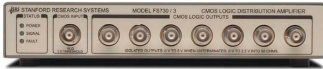
FS730/3 Front Panel

FS730 and FS735 series — CMOS Logic Distribution Amplifier