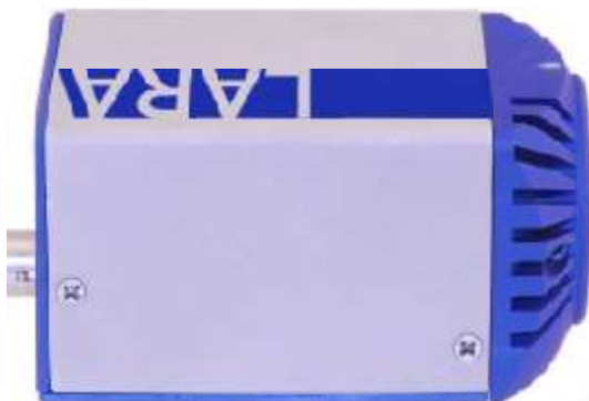
LARA Camera, Side View