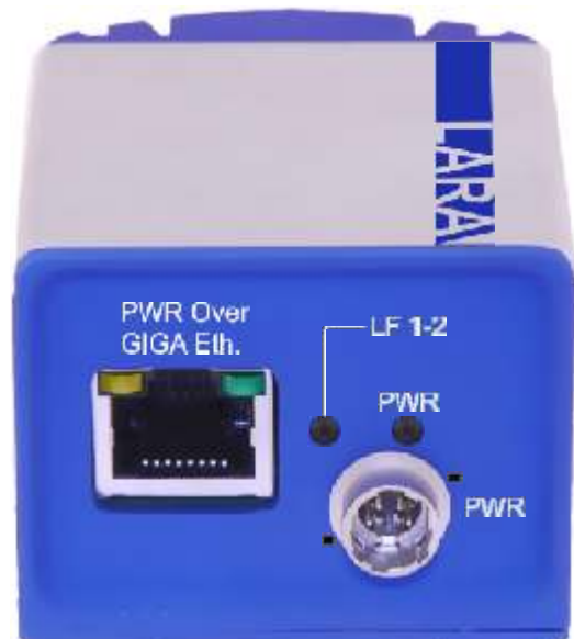
LARA Camera, Rear View