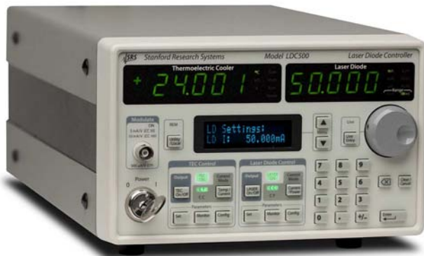
LDC500 Front Panel

The LDC500 series offers an auto-tuning feature which automatically optimizes the PID loop parameters of the controller. Of course, full manual control is provided too. Dynamic transfer between CT and CC modes for the TEC is also easy — just press the Temp/Current button.