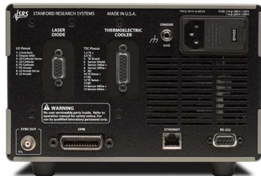
LDC500 Rear Panel