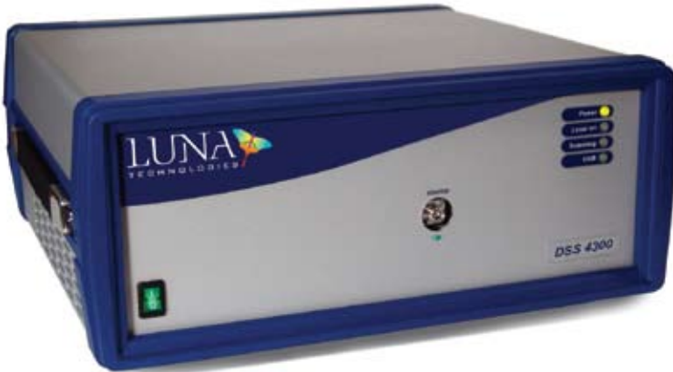
DISTRIBUTED SENSING SYSTEM (Model DSS™ 4300)