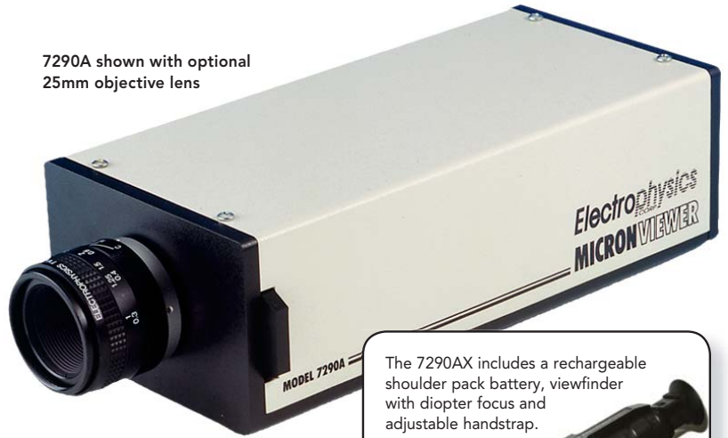
The 7290AX includes a rechargeable shoulder pack battery, viewfinder with diopter focus and adjustable handstrap.