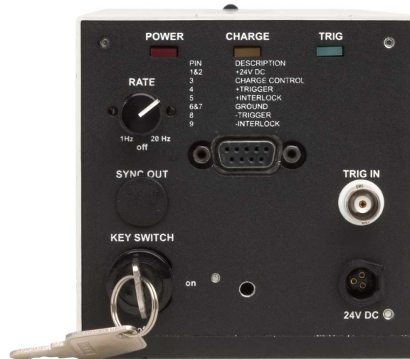
NL100 rear panel