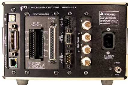
PPM100 rear panel

An embedded web server connects the PPM100 to the world wide web (password protected). The EWS can deliver measurement data to any standard internet browser. Use the EWS to monitor and control your vacuum system or to get automatic email notifications of potential or real system problems.