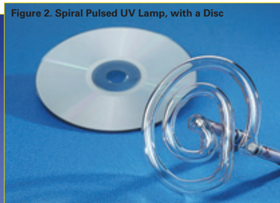
Figure 2. Spiral Pulsed UV Lamp, with a Disc