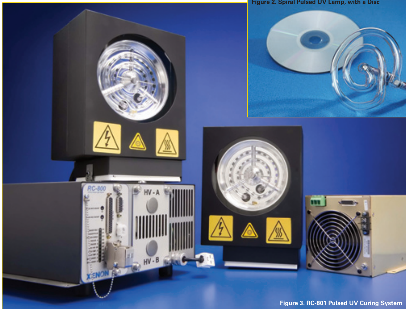
Figure 3. RC-801 Pulsed UV Curing System

The Blu-ray Disc format requires a transparent 100-micron-thick UV-curable resin coating, which also includes a thin, hard topcoat. The scratch-resistant topcoat allows the disc to be used without cassette packaging. The manufacturer had trouble rapidly curing the thick coating on the disc and could not achieve an acceptable cure around the perimeter of the disc.