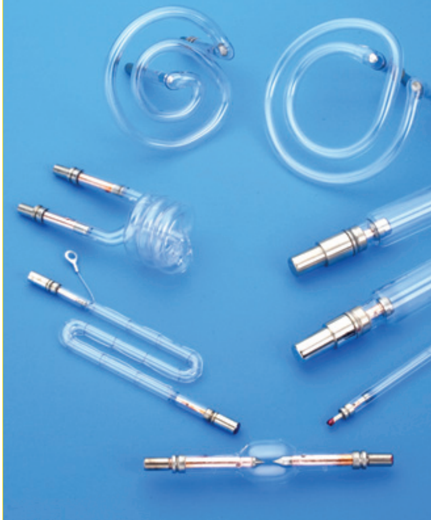
Figure 6. Pulsed UV Lamps Come in a Variety of Shapes and Sizes to Match the Optical Footprint

In addition to general spectral shifts, the spectrum and sequencing of each individual pulse can be tuned to critically match the absorption requirements of chemical formulations. Consider a single pulse: at the beginning of the pulse, the output is delivered at shorter wavelengths. As the pulse continues in time, the output moves toward longer wavelengths. The amount of UV, visible and IR delivered can be adjusted for a specific application.