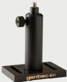
Stand with Delrin Post