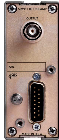
SIM911 rear panel