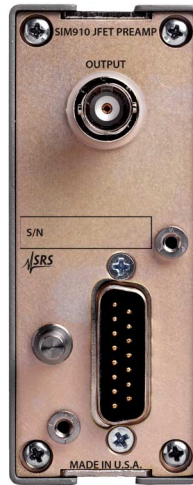
SIM910 rear panel