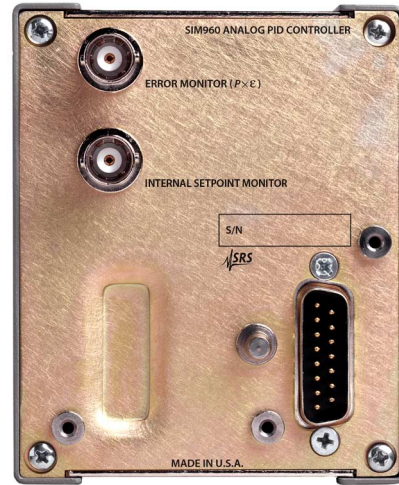
SIM960 rear panel