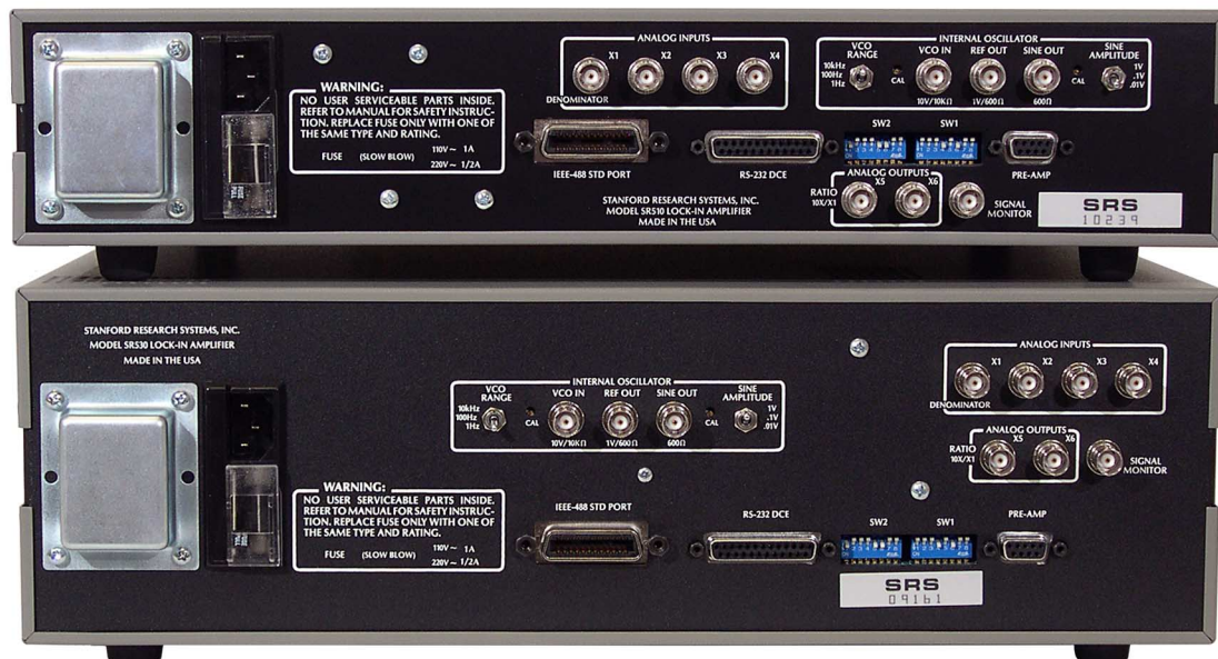
SR510 and SR530 rear panels (with opt. 01)