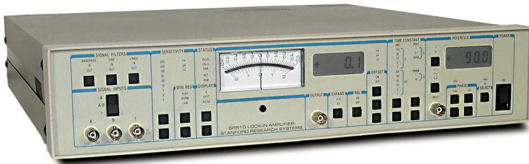
SR510 Lock-In Amplifier

An internal voltage-controlled oscillator provides both an adjustable-amplitude sine wave output and a synchronous, fixed-amplitude reference output. The sine wave amplitude can be set to 0.01, 0.1 or 1 Vrms, and it can drive up to 20 mA. The oscillator frequency is controlled by a rear-panel voltage input and can be adjusted between 1 Hz and 100 kHz. Typically, the sine wave output is used to excite some aspect of an experiment, while the reference output provides a frequency reference to the lock-in.