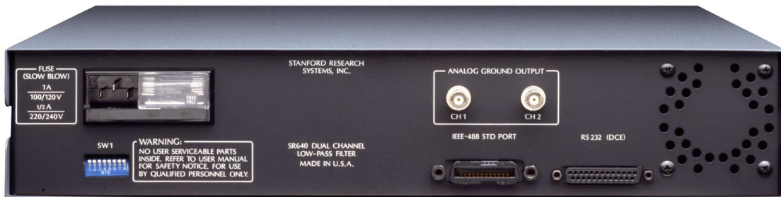
SR640 rear panel