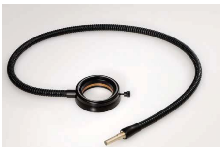
Annular ringlight 66 mm