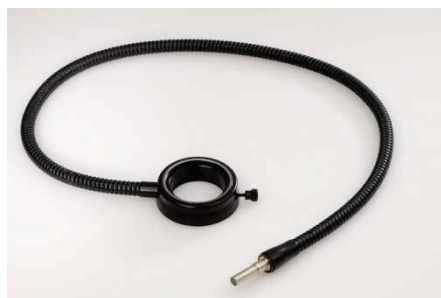
Annular ringlight 58 mm