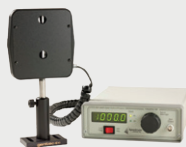
SDC-5000 Digital Optical Chopper