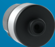
THZ5I-MT-USB (5 mm-Metallic)