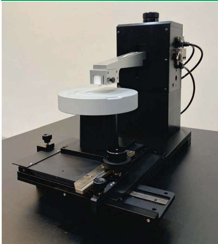
SR-4 equipped with chuck stage and hot chuck