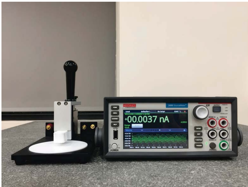
R-2 paired with Keithley 2450 SMU