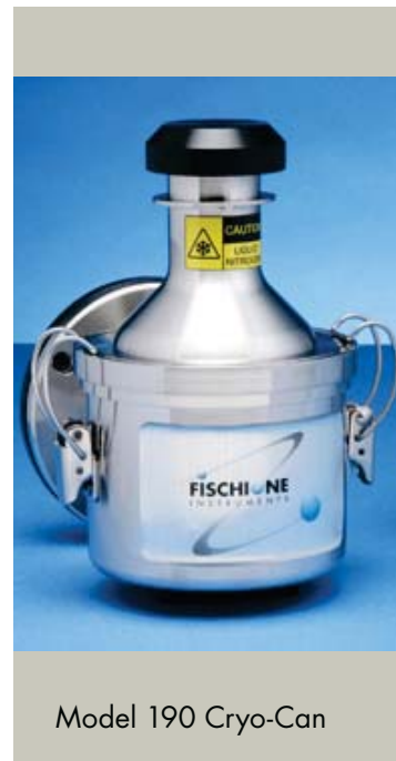
Model 190 Cryo-Can

All system components are easily accessible for service. The ion source is designed for both long component life and extended maintenance intervals. When needed, the filament can be readily replaced. Password-protected diagnostic software allows complete control over all instrument functions.