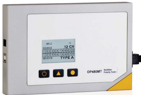
The OP480MT provides a simple, handheld solution for testing polarity of multifiber connectors such as MTP/MPO, MXC, and PRIZM.