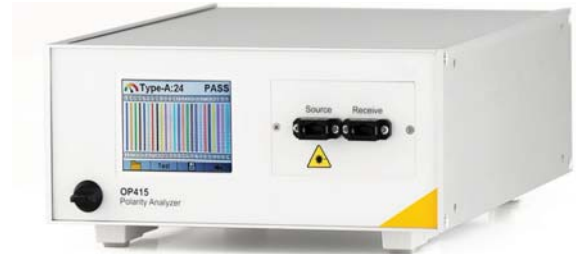
Model OP415 Polarity Tester

The OP415 Polarity Analyzer provides multiple capabilities for your MTP®/MPO cable production and R&D facilities.