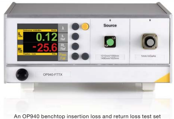
An OP940 benchtop insertion loss and return loss test set displaying color-coded ILRL test results

The OP940 system is an insertion loss (IL) and return loss (RL) meter that features a color LCD screen, an optical reflectance scan mode, programmable pass/fail for editable test criteria and on screen context help. Additionally, the OP940 can measure return loss (RL) at two positions simultaneously through the front panel and it offers expandable functionality. As with our other IL/RL systems, the OP940 measures RL quickly and accurately without the need for mandrel wrapping or the use of index matching gel, and is available in Single Mode, Multimode, and FTTX variants.