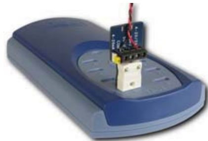
Figure 2: The terminal board fitted to the USB TC-08

The voltage displayed in PicoLog corresponds to the input voltage as follows: