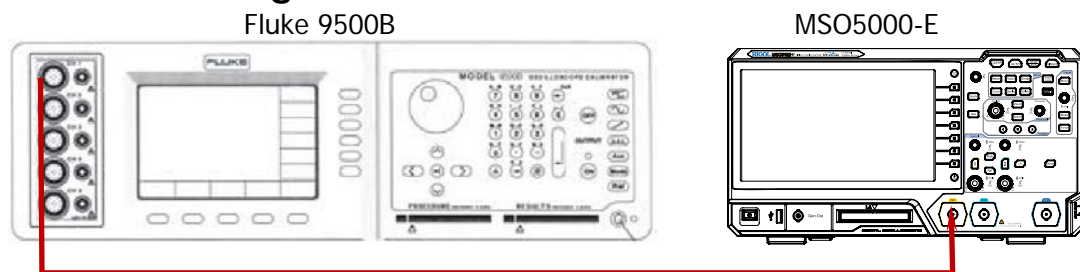
Figure 2-4 Bandwidth Limit Test Connection Diagram