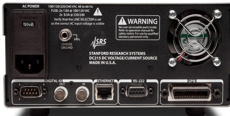
DC215 rear panel