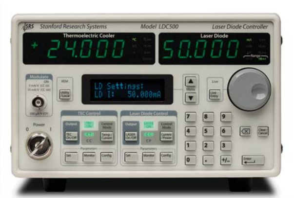
LDC500 front panel

The LDC500 series offers an auto-tuning feature which automatically optimizes the PID loop parameters of the controller. Of course, full manual control is provided too. Dynamic transfer between CT and CC modes for the TEC is also easy — just press the Temp/Current button.