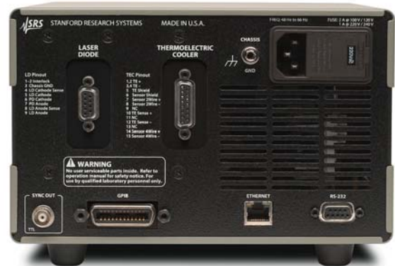
LDC500 rear panel