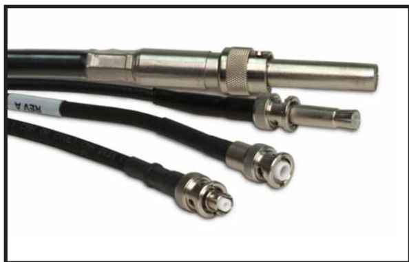
High voltage cables

The PS300 Series High Voltage Power Supplies are as useful in the R&D lab as they are in automated test applications. Wherever you are using them, the PS300 Series provide proven reliability and performance at a very affordable price.