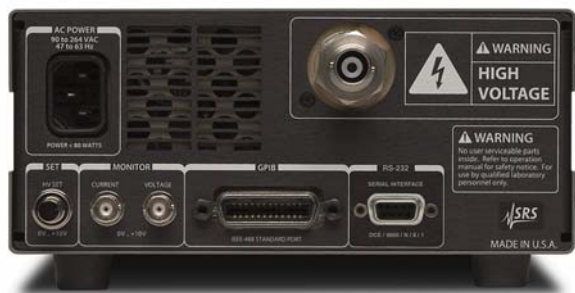
PS370 rear panel

Both GPIB and RS-232 computer interfaces are standard on all 10 W supplies. GPIB is available as an option on the 25 W instruments. All parameters can be set and read via the computer interfaces.