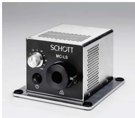
MC-LS Light Source, A20990

As the standard LED fiber optic light source in the SCHOTT ColdVision range, the MC-LS delivers exceptional light output from its high-brightness LED engine. Developed for stereo microscopy, the design of the light source makes it highly suitable for desktop usage, where its USB port can easily connect to application software systems