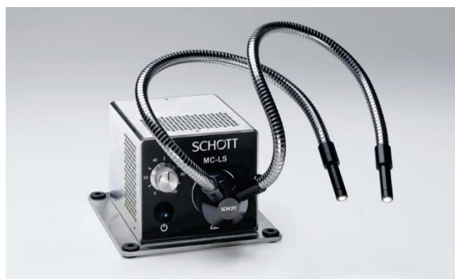
A20990 with gooseneck attachment