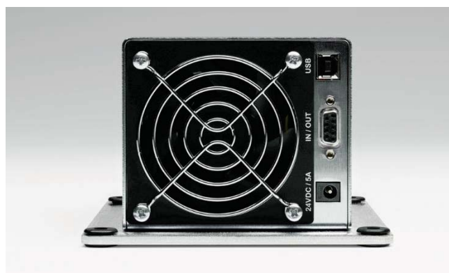
A 20990 Rear view