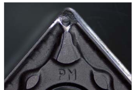
Indexable insert, shows tool wear. Reflected light, ringlight, zoom 0.8x