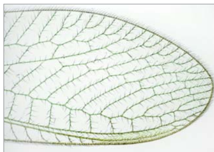
Green lacewing Transmitted light brightfield